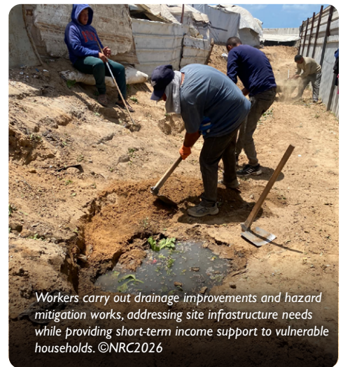
Workers carry out drainage improvements and hazard mitigation works, addressing site infrastructure needs while providing short-term income support to vulnerable households.