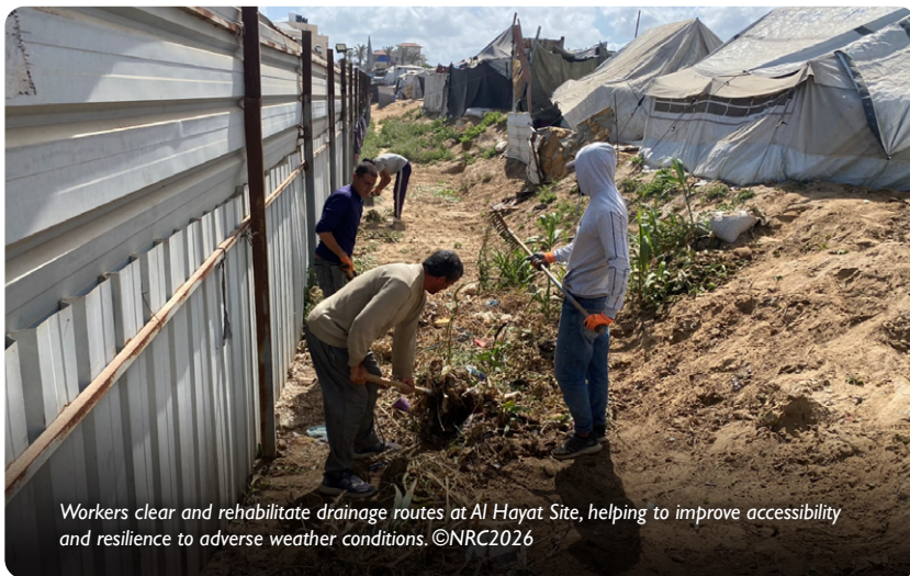
Workers clear and rehabilitate drainage routes at Al Hayat Site, helping to improve accessibility and resilience to adverse weather conditions.

As part of NRC's broader site management activities targeting 30 sites with support from IOM, the intervention at Al Hayat contributed to improved living conditions, strengthened resilience, and enhanced dignity for displaced communities.