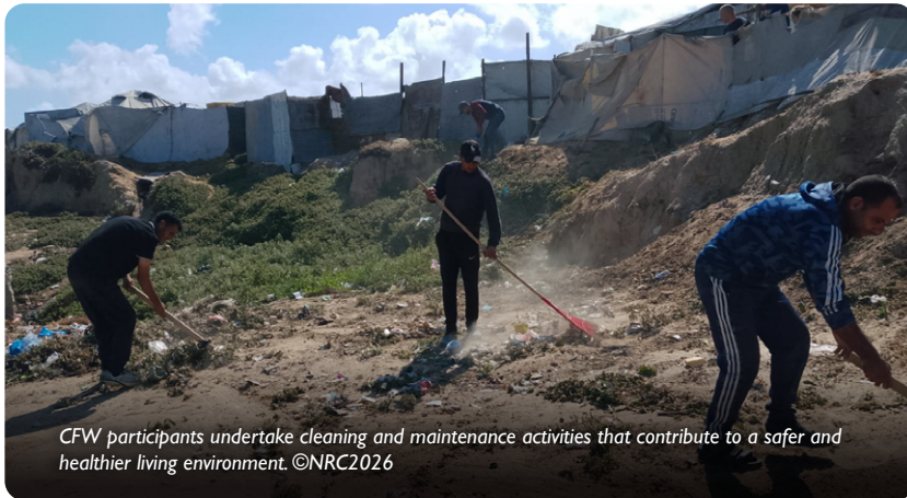
CFW participants undertake cleaning and maintenance activities that contribute to a safer and healthier living environment.

At Al Hayat Site, the Norwegian Refugee Council (NRC), with support from IOM, implemented a cash-for-work (CFW) initiative that combined income support with essential site rehabilitation. The programme engaged 20 residents in paid activities, directly improving living conditions for the wider community.